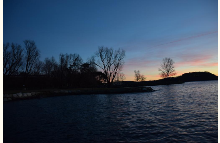
Lake Maggiore during sunset

There are hotels and B&B in which you can see the Lake from your window.