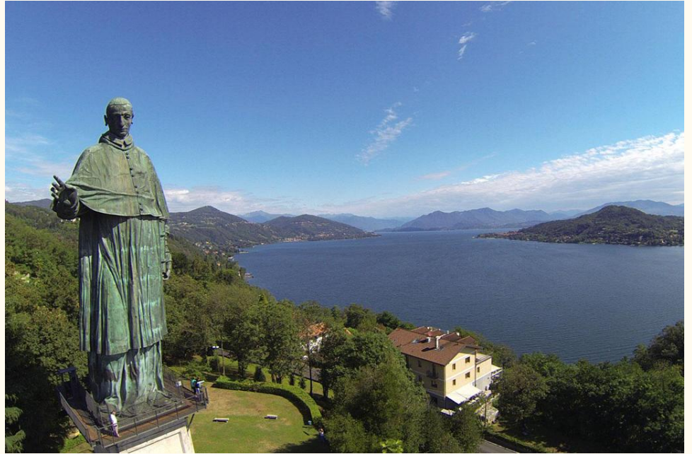
Saint Charles Borromeo's statue (35 meters high)